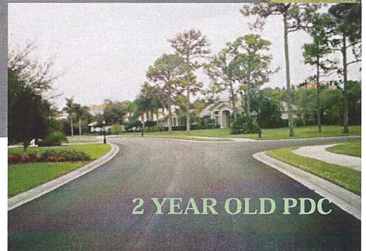
2 YEAR OLD PDC

Call today to see if your property qualifies for the best asphalt maintenance program